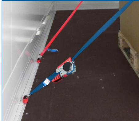
circulating in the ground (always!)