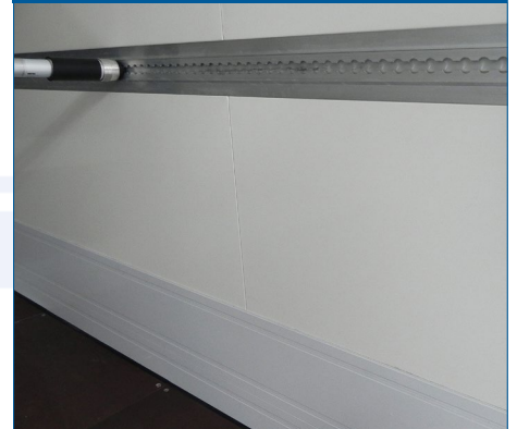
recessed in the walls