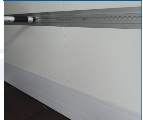
recessed in the walls (GRP-Foam)